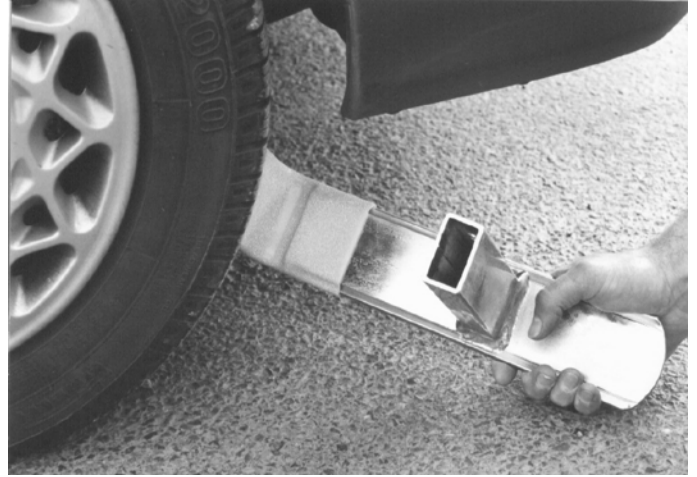
2. Position inner arm behind wheel, hook into rim.