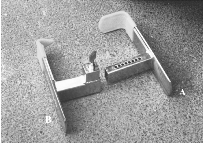
1. A - Inner Arm. B - Outer Arm.