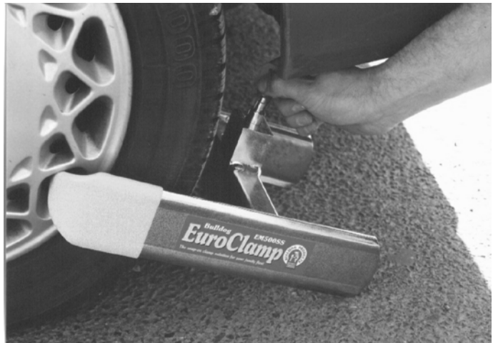
4. To remove clamp, insert key, rotate 1/2 turn, pull on key and/or press inner and outer arms together until lock pops out.

We have taken every care in the design and manufacture of this security device and we believe that it is an effective deterrent. However we cannot guarantee that it will resist the efforts of the most determined thief, and as such we do not accept any liability for loss or damage caused by theft, vandalism or other illegal activity against property to which this device is fitted.